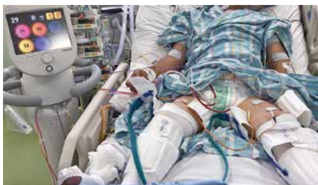
Figure 4. Electrical muscular stimulation in a critically ill patient. Bilateral upper and lower limbs were stimulated by electrical muscular stimulation (Solius, Minato Medical Science Co., Osaka, Japan). Patient consent was obtained for the use of this image.

Ventilator settings preventing diaphragm muscle atrophy are termed “muscle-protective ventilation” (98). This strategy aims at maintaining spontaneous breathing and titrating ventilatory support to obtain sufficient respiratory effort, but some patients with ARDS need ventilator settings without spontaneous breathing to avoid ventilator-induced lung injury (99). However, the setting without spontaneous breathing should be carefully used because this mode leads to prominent diaphragm atrophy of -7.5\% \pm 12.3\% per day (60). Similarly, excessive respiratory support should be avoided because higher inspiratory pressure leads to further diaphragm atrophy (daily atrophy ratio; -5.6\% \pm 12.9\% in \geq 12 cmH 2 O vs. -1.5\% \pm 10.9\% in 5–12 cmH 2 O) (60). The optimal ventilator settings can be adjusted by ultrasonographic measurement of the diaphragm thickening fraction [thickness at inspiration – thickness at expiration]/[thickness at expiration] × 100 (%) (34). The diaphragm thickening fraction represents the respiratory effort by the patient (100). For better clinical outcomes, the thickening fraction should be maintained from 15% to 30%, which is the same range during spontaneous breathing in healthy adults (15).