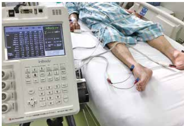
Figure 3. Bioelectrical impedance analysis The whole-body muscle mass was measured by bioelectrical impedance analysis (InBody S10®, InBody Co., Seoul, South Korea). Patient consent was obtained for the use of this image.

BIA can be used at the bedside (Fig. 3). BIA indirectly measures whole-body muscle mass from the impedance using a weak electric current. The muscle mass, measured by BIA, correlates well with the CT assessment in critically ill patients (77). However, edema complicates the impedance and muscle mass measurement, and muscle mass was thus overestimated in edematous patients (77). Muscle mass monitoring during ICU stay may be unreliable because critical ill patients exhibit an abnormal fluid status (78).